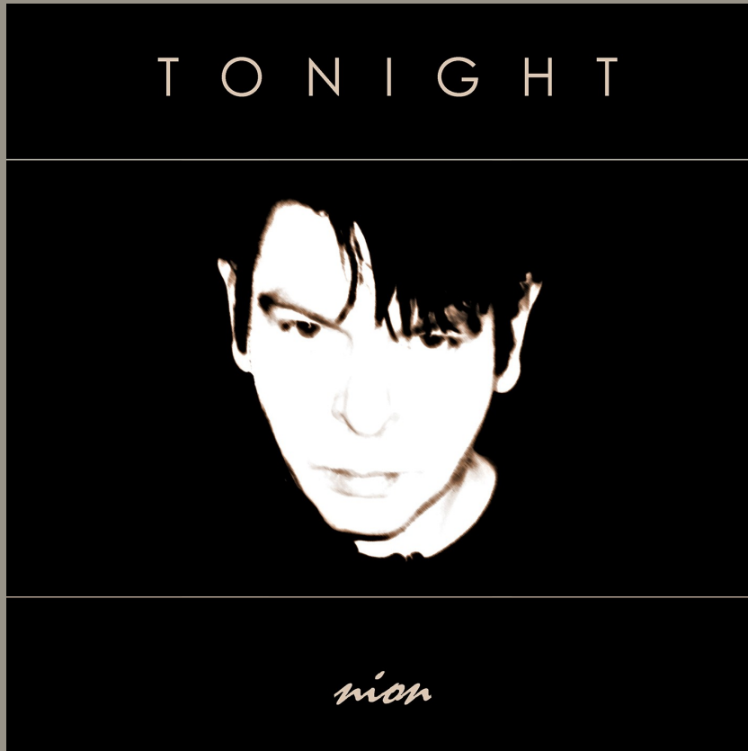
TONIGHT RELEASED: DECEMBER 2013