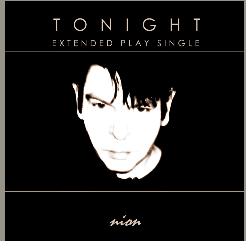
TONIGHT (EXTENDED PLAY SINGLE) RELEASED: DECEMBER 2013